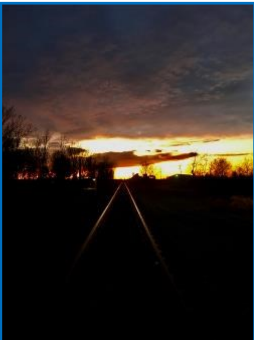
Sunrise on the Madisonville, Harford & Eastern at Hwy 85, Anton KY, December 22, 2018.